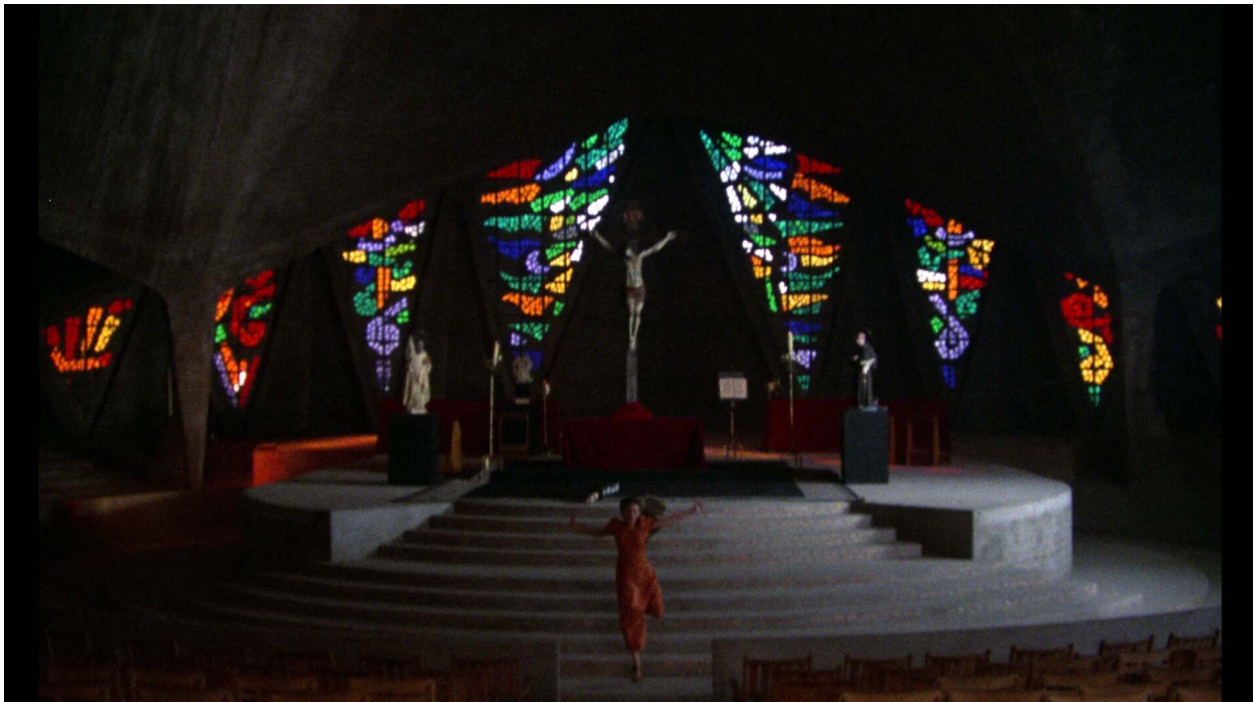
Exorcismo dir. Alberto Sedano

Fear in Focus is back with a special Spain edition! The festival's perennial sidebar, once again presented by Arrow Video , which celebrates a specific region's exceptional work within horror, turns its eyes to one of the original and most enduring purveyors of the genre.