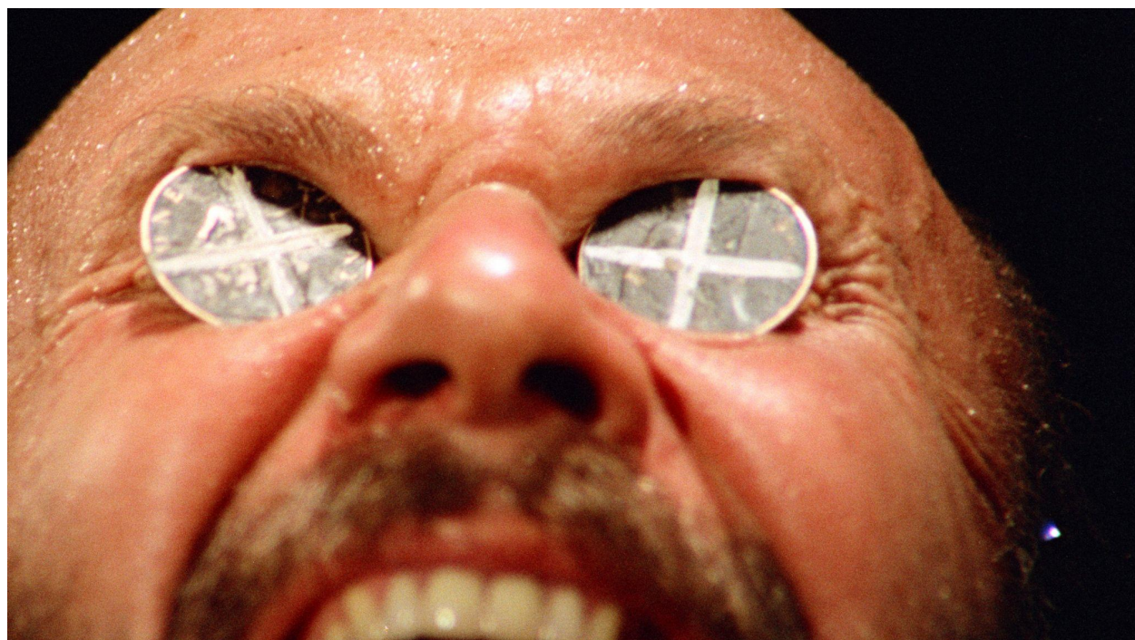
Wake in Fright 4k Restoration dir. Ted Kotcheff